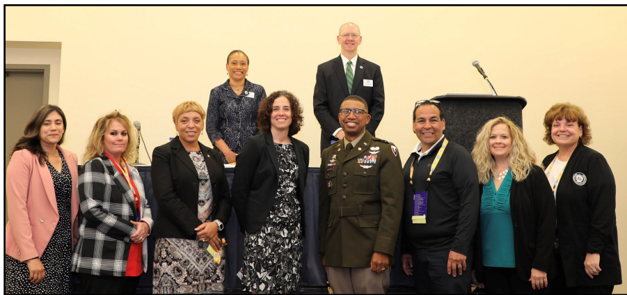
Community Projects Award Winners