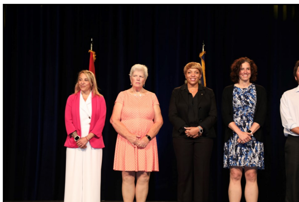
Chapter Competition Award Winners